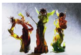
The Three Furies, 2005