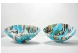
Skyform duo, 2017.