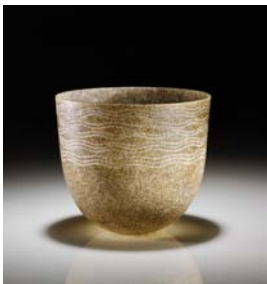
Olive green pâte de verre vessel, 2013.

Saturday, 20 October 2018, 10.30am - 4.30pm (doors open 10.15am) Brockway Room, Conway Hall, Red Lion Square, London WC1R 4RL