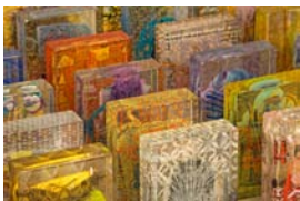
Encyclopaedia Volumes (detail), 2012-2016.